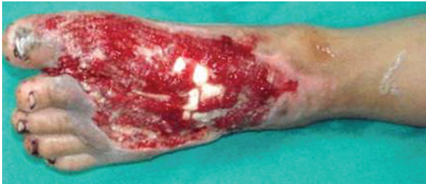
Fig. (2): After debridement.