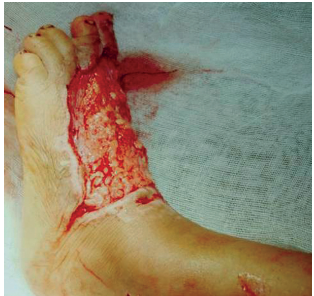
Fig. (6): Insitting of the flap.