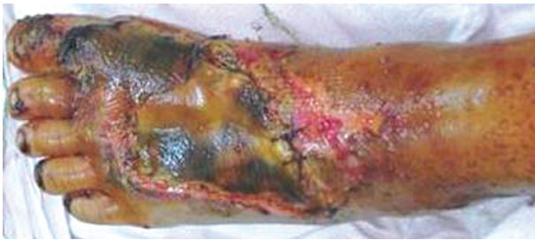
Fig. (1): Preoperative lesion.