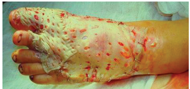
Fig. (7): Skin grafting.