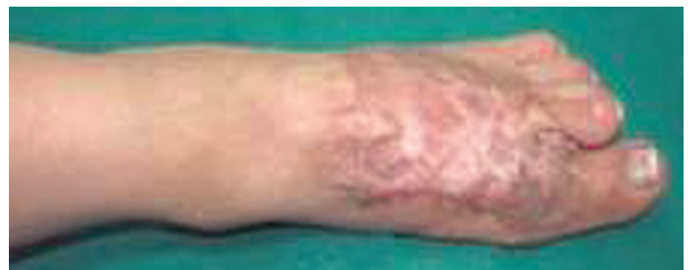
Fig. (8): 9 months postoperative results.