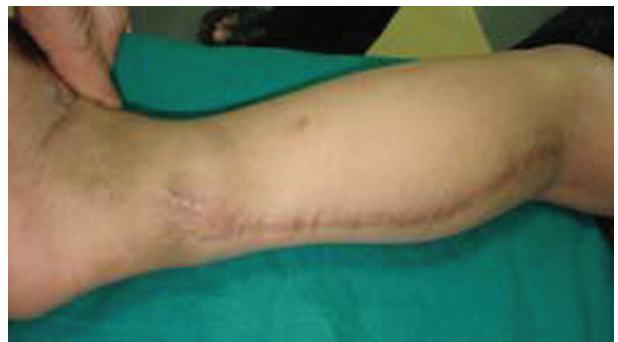
Fig. (9): Donor site 9 months postoperative.