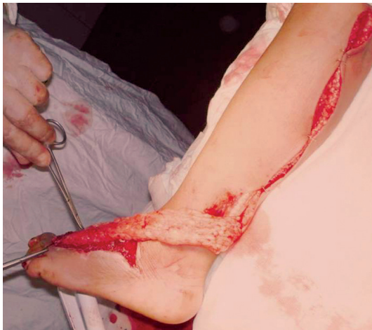
Fig. (5): Turning of the flap.