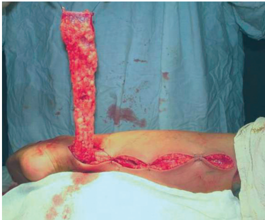
Fig. (4): Adipofascial flap raising.